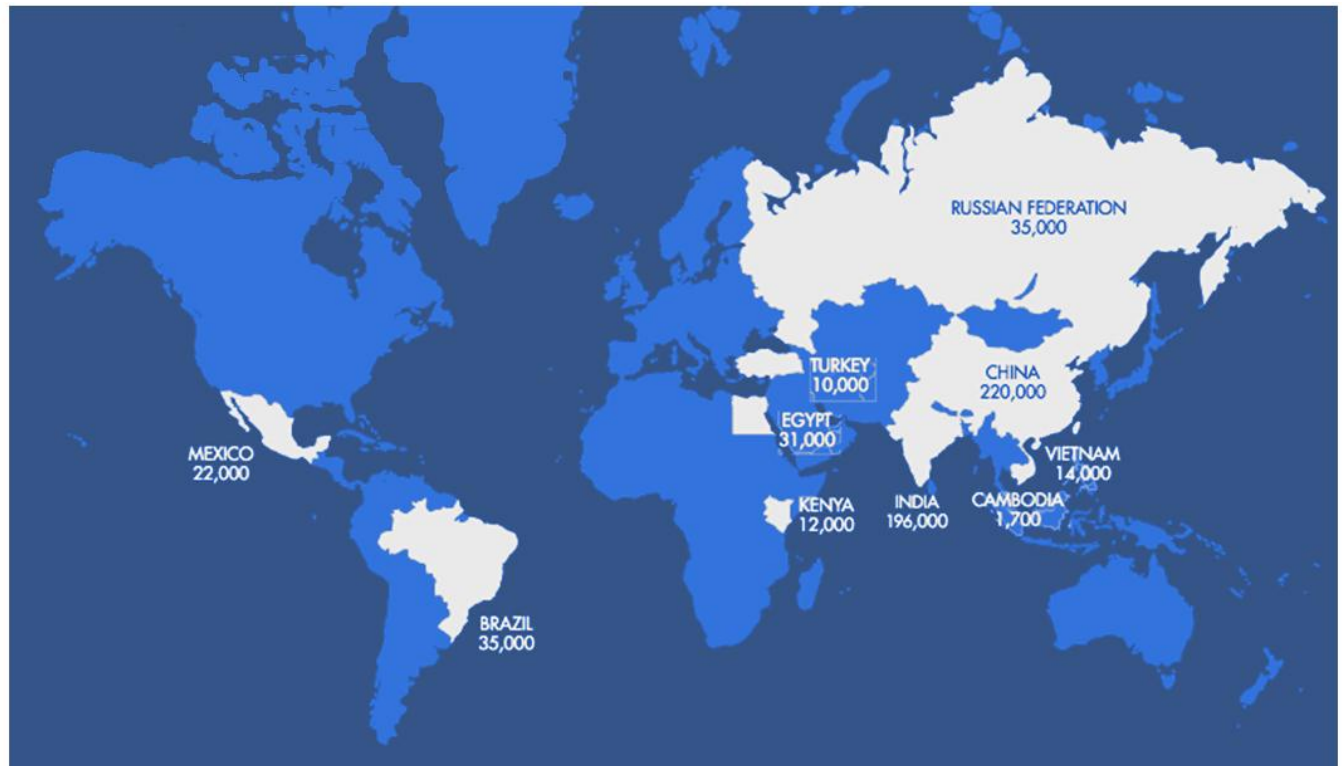
Road Fatalities in countries